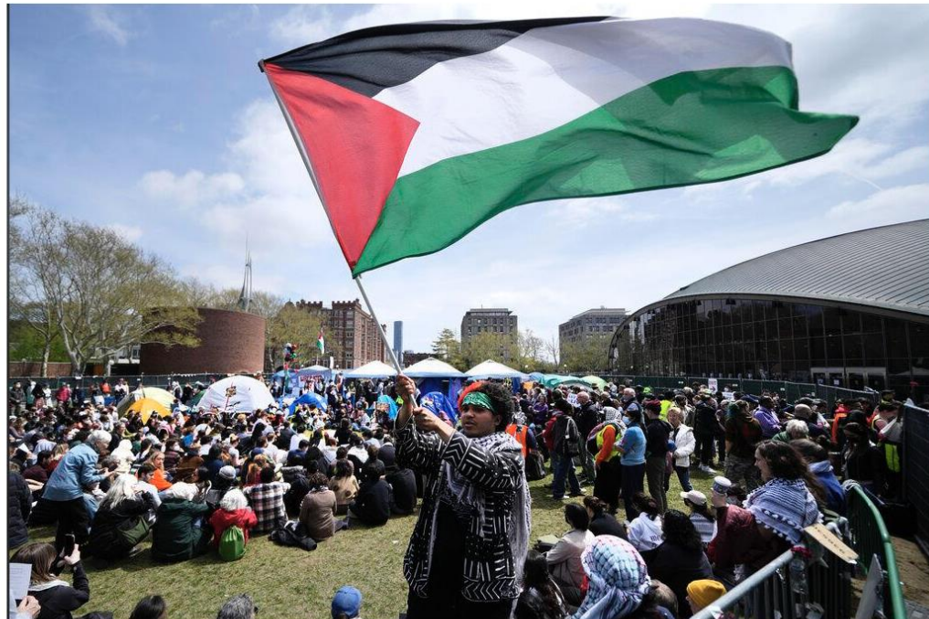
Students gather at a pro-Palestinian student encampment on the campus of the Massachusetts Institute of Technology,