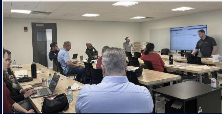
Faculty and Academic Development