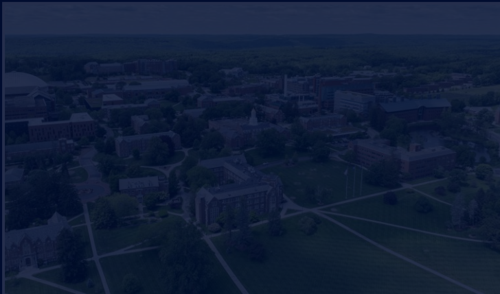
Schools and Colleges