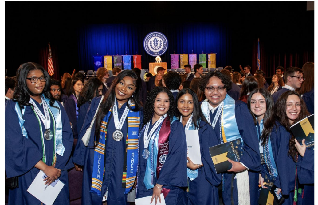
Graduating students are recognized at the 2024 Honors Medals Ceremony.

UConn's Honors program is unique in the nation for its evidence-based curriculum and programming