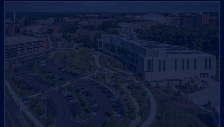
Centers and Institutes